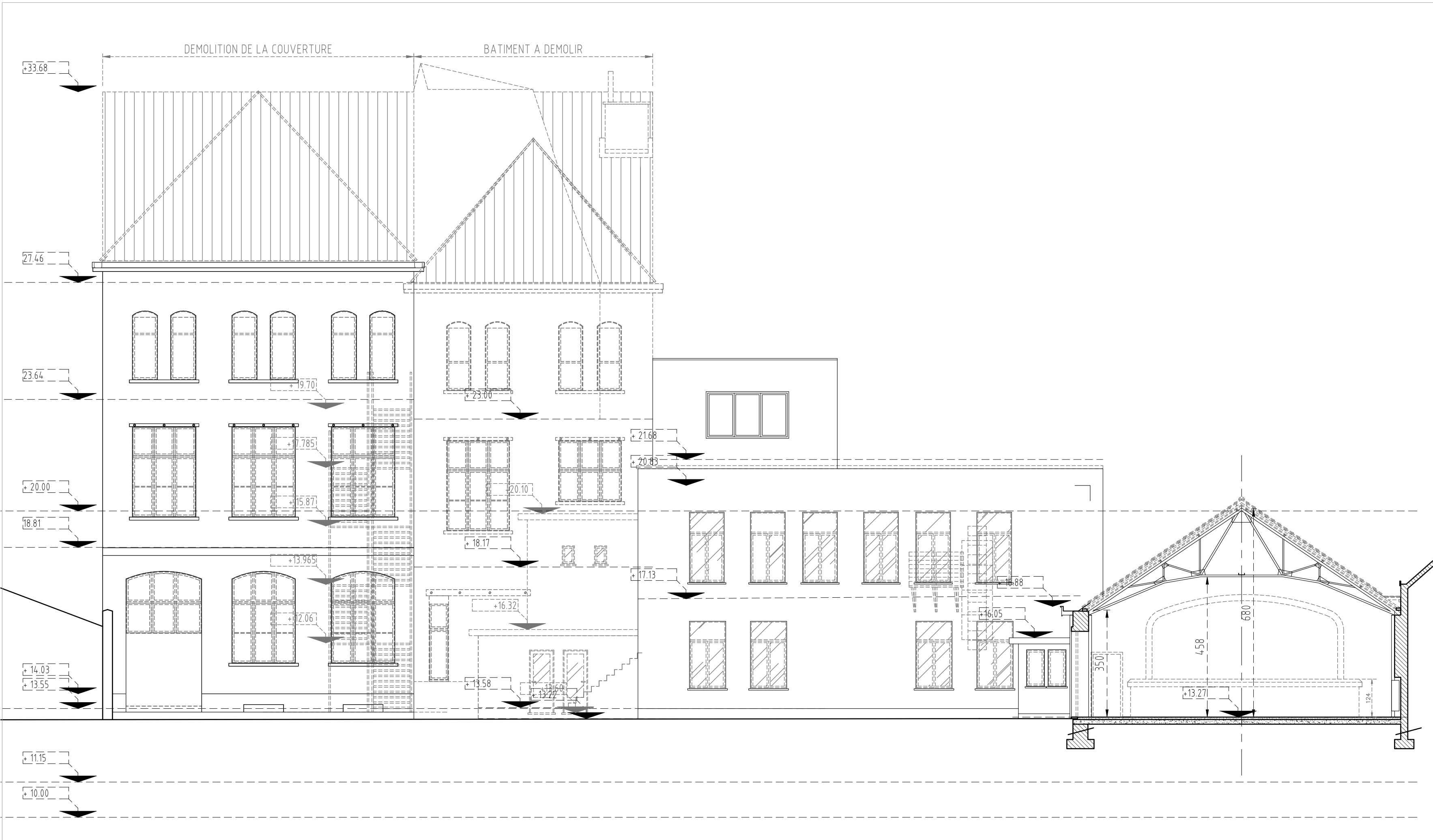
COUPE TRANSVERSAL A - 1/100